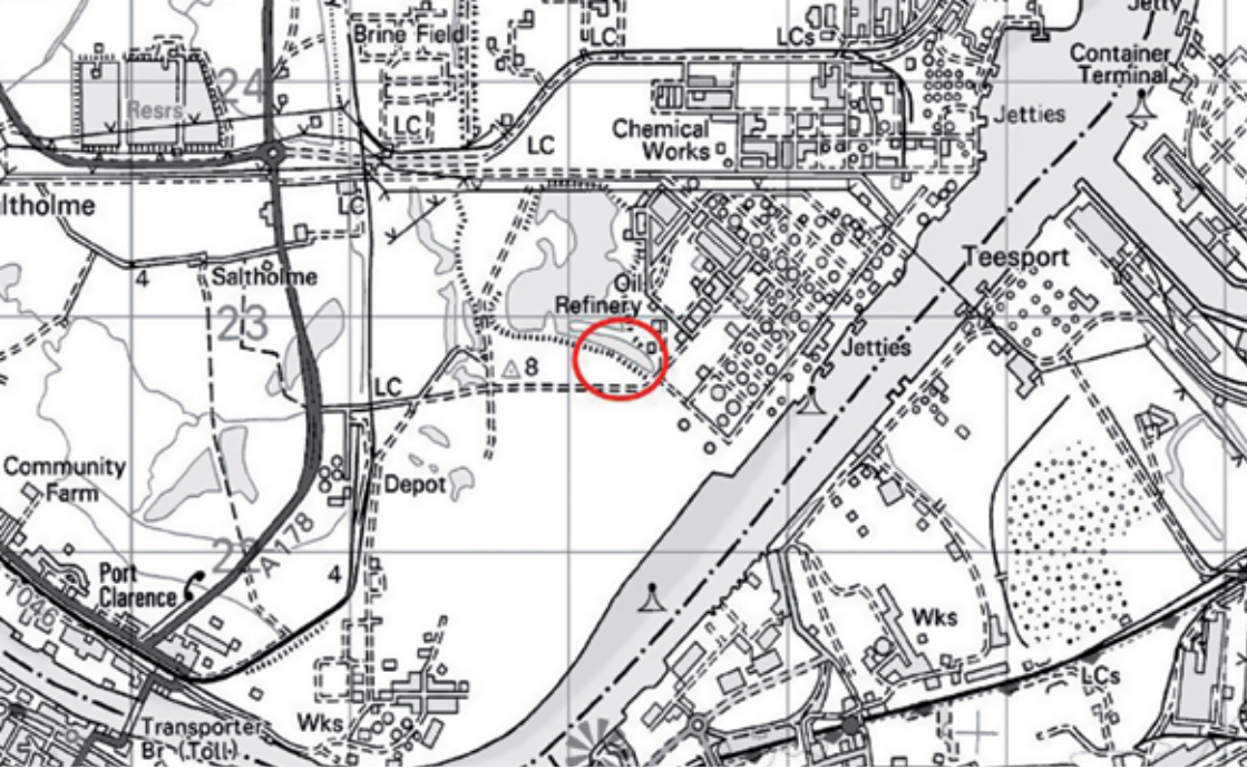
Proposed location - the Reclamation Pond site.